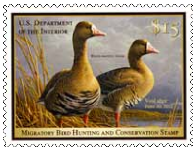
Federal Conservation Duck Stamp