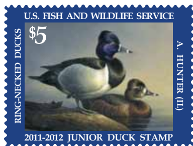
Federal Junior Duck Stamp